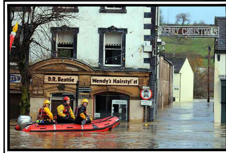
1 in 500 year event: Cockermouth: River Derwent November 2009

This does not mean that the flood will occur once every fifty years; it could occur tomorrow and again next week, or not for 500 years. For example, the Bowmont Water suffered from 1 in 150 year and 1 in 200 year events in the space of 10 months