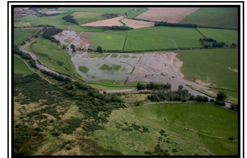
1 in 200 year event: Yetholm: Bowmont Water July 2009