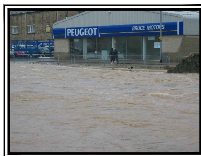
1 in 50 year event: Hawick: River Teviot October 2005