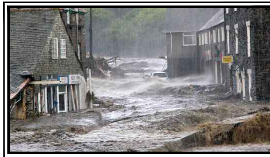
1 in 400 year event: Boscastle: River Valency August 2004