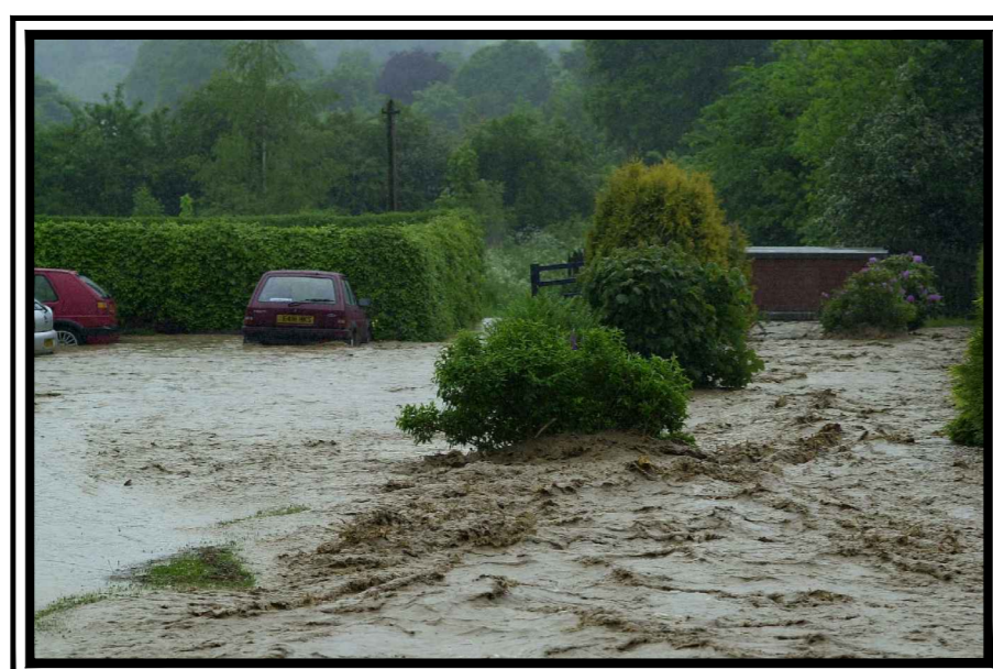
1 in 50 year event (approx): Selkirk: Long Philip Burn May 2003