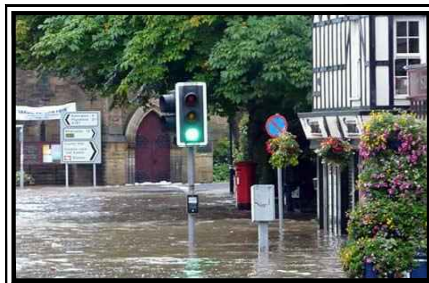
1 in 150 year event: Morpeth: River Wansbeck September 2008