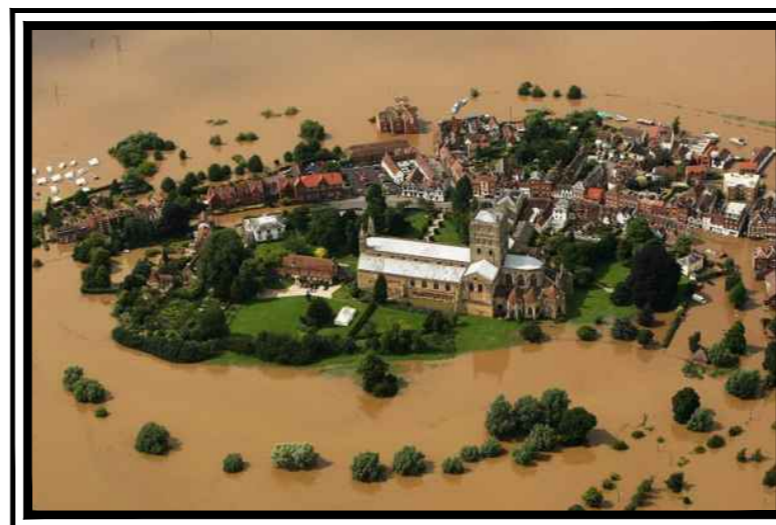
1 in 200 year event: Tewkesbury: River Severn July 2007